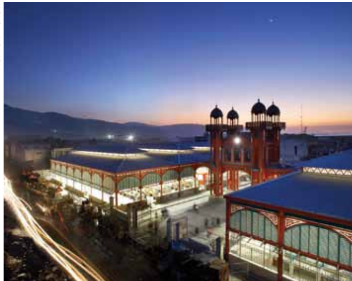
HUFTON + CROW