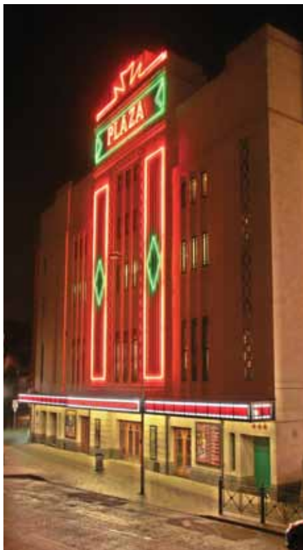
BROCK CHARMICHAEL ARCHITECTS

The Grade II* listed Plaza is nationally the only cinema of its type operated by a charitable trust - Stockport Plaza Trust, with the specific purpose of restoring the building to its original form and function. The design of the building clearly defines its function and the restoration of the building has been done sensitively and with respect to the original. Delivered to a very high standard with excellent attention to detail, it provides a renewed cultural, social and popular destination in Stockport. Its contribution to civic pride, identity and community benefit goes without saying.