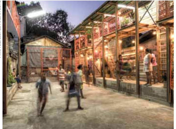
TYIN TEGNESTUE ARCHITECTS