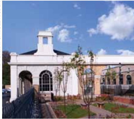
RE-FORMAT & NIGEL RIGDEN