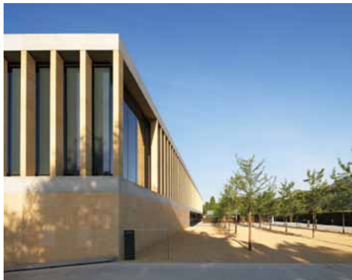
HUFTON + CROW