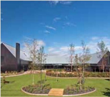
HCC PROPERTY SERVICES