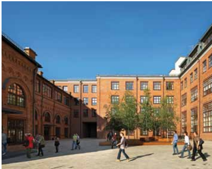
HUFTON + CROW