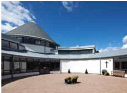
TOM ROE, BEACONS IMAGES